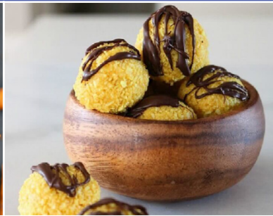
Chocolate Turmeric Truffles with Coconut Oil PG-26