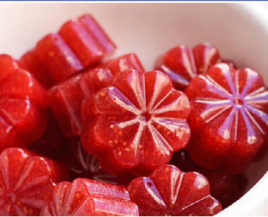
Homemade Sour Strawberry Gummies PG-29