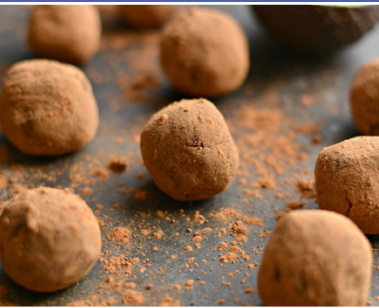
Silky Dark Chocolate Avocado Truffles PG-20