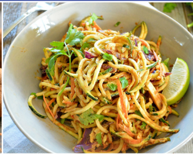
Spicy Sesame Almond Zucchini Noodles PG-30