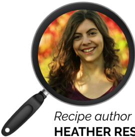
Recipe author HEATHER RESLER cookituppaleo.com