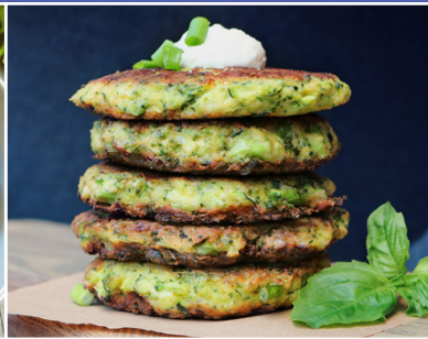
Crispy & Easy Zucchini Fritters PG-26