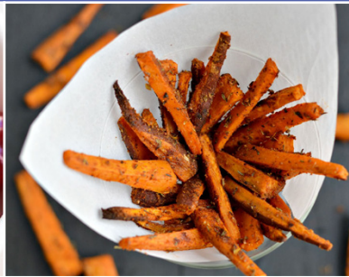
Cajun Sweet Potato Fries PG-41